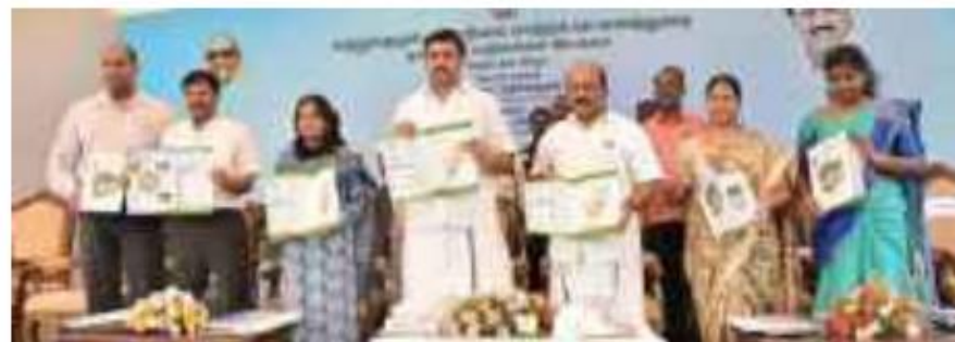
Minister for Forest M. Mathiventhan, MSME Minister T.M. Anbarasan, and Additional Chief Secretary to the Department of Environment Supriya Sahu launching the wetlands mission.

The Otteri lake is spread over 16 acres with a storage capacity of 2.22 million cubic feet. The area around the lake attracts 12 species of birds. "The objective of the ecological restoration is to increase