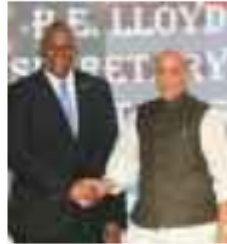
Rajnath Singh with Lloyd Austin

Mr. Austin reached India on Sunday evening from Singapore on a two-day visit. He was given a tri-service guard of honour